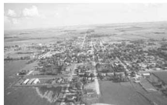
Serving the South Loup River Valley